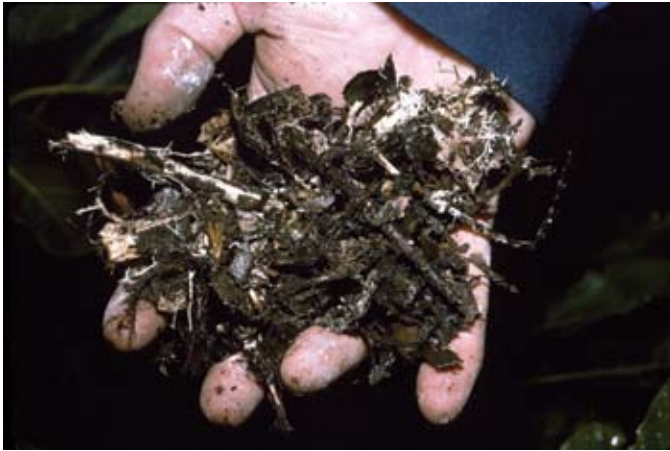
Figure 3. Fungi grow through mulch with mycelium and rhizomorphs that secrete enzymes (cellulases) which have been shown to control root diseases.