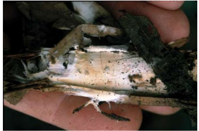
Figure 4. Ceraciomyces tessulatus is a potent cellulase producer. The fruiting body looks like paint on the wood surface it is decaying.

A coarse mulch layer cuts evaporative water loss from soils thus preserving moisture for root absorption. This source of moisture is especially useful to shallow rooted trees such as avocado. I have found in various studies that mulched trees can skip every other irrigation compared to non-mulched trees and maintain the same soil matric potential (Downer, 1998; Downer and Hodel, 2001; Downer and Faber, 2005). The caveat here is that the mulch must be coarser than the underlying soil. Mulches texturally finer than the soil underneath them can lead to increased moisture loss and drying (Svenson and Witte, 1989). Moisture savings by mulches is greatest when there is maximum exposure of soil to the sun, before