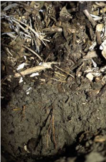
Figure 2. Avocado roots proliferate in the interface of mulch and soil. Old roots can be seen growing in lower soil layers, these roots are less vigorous and more susceptible to avocado root rot than those growing in or near mulch layers.

ganic mulches still seem to stimulate growth increases (Foshee et al., 1999), again suggesting that nutrient additions are less important to growth response than other possible mulch benefits. While Faber et al. (2000) found that nutrients accumulated in