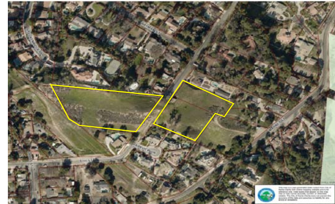
8 th Street/ Wayman Street