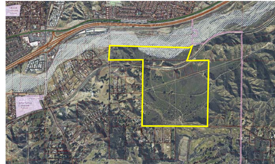
North of Oak Springs Canyon Road